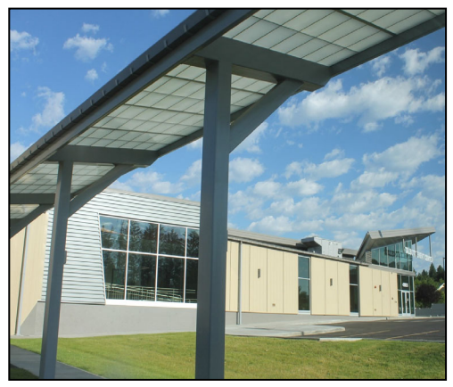
NEWESD 101 Talbott Event Center

Budgeted expenditures: $23.6 million, FY ending August 2020.