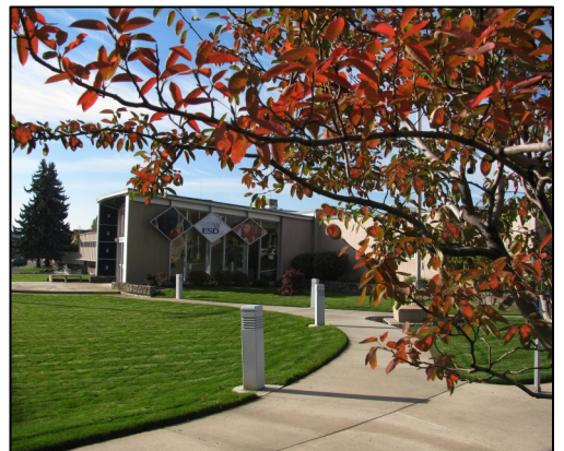
NEWESD 101 headquarters

Budgeted expenditures: $20.7million, FY ending August 2018.