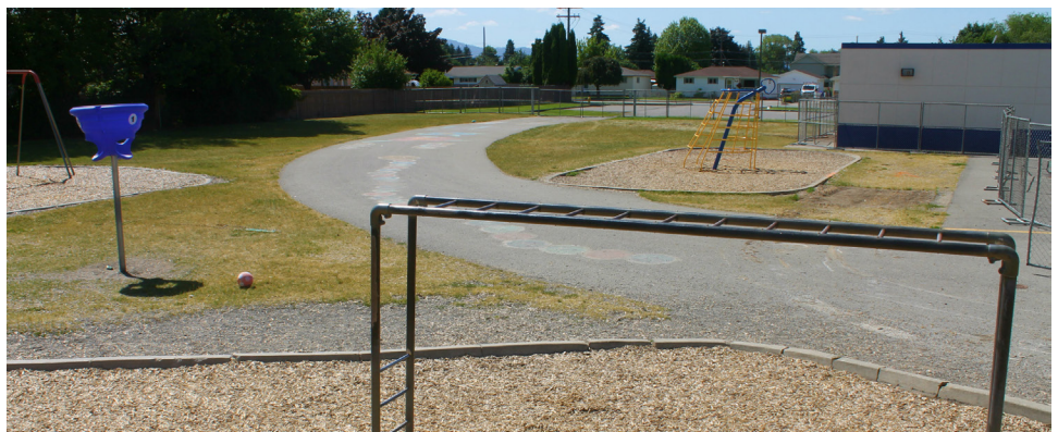
Trentwood Elementary: Play structures will be relocated to the north side of the building, making way for a parking area on the east side, shown here.